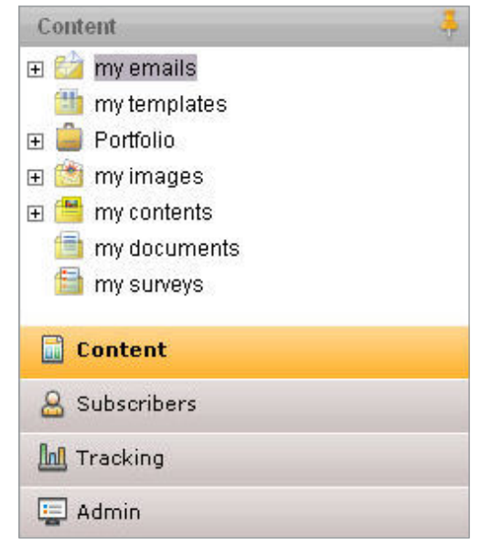
Figure 1: Intuitive, easy-to-use interface

Our Core Edition provides a rich set of core email marketing features that goes beyond what is typically available from cheaper blast services, and will meet the email marketing needs of any firm.