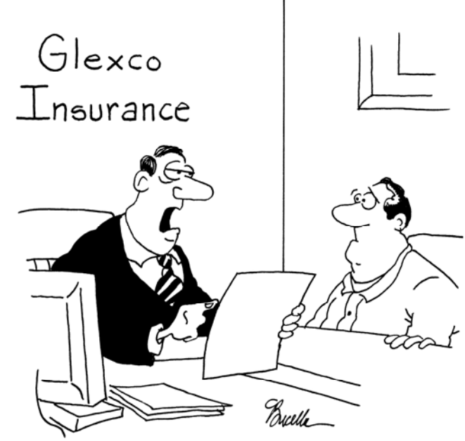
"I think you misunderstood. The million dollar umbrella policy only covers you for claims involving an umbrella."