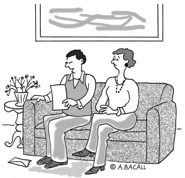
"It says our homeowners insurance policy is subject to the following forms and endorsements, Mumbo 1590 and Jumbo 9033."