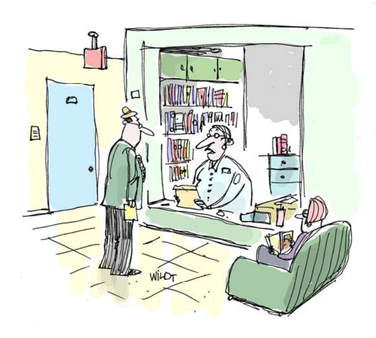
"You're denied coverage because of your pre-existing condition of having lousy health insurance."