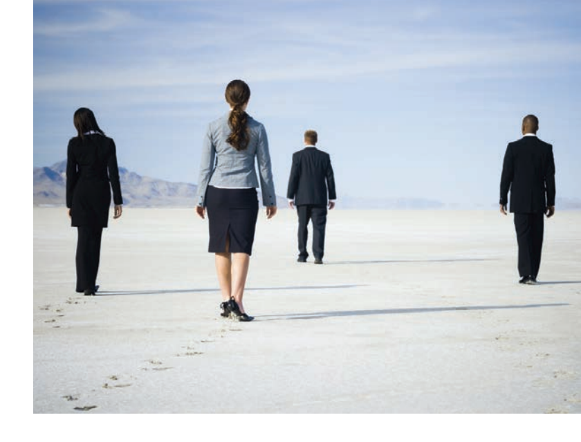
In my experience, a settlement is usually reached where both parties have subsequently crossed their lines in the sand.

It is sometimes suggested that mediation should be attempted as soon as a dispute crystallizes, and it is increasingly written into construction contracts as a precursor to other ADR procedures. In many disputes, speedy resolution is key to the continuation of a project or the survival of a business relationship (or even a business). Where friendly enemies want to resolve a problem without souring their relationship by going to litigation, where the settlement may involve remediation of defects or where the imperative is to reach a commercial resolution without the need to explore the merits of the dispute, there is every reason to mediate early.