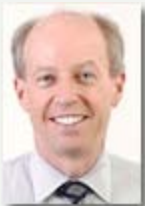
Patrick Malone & Associates

Networking Nightmares Tips for Smart Posting Connect with Respect