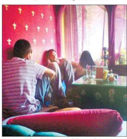
■ हुक्का बार : पुलिस और प्रशासन ताक रहे हैं एक-दूसरे का मुंह ।

हक्का बार्स को न तो कोई लाइसेंस दिया गया है और न ही इसके लिए