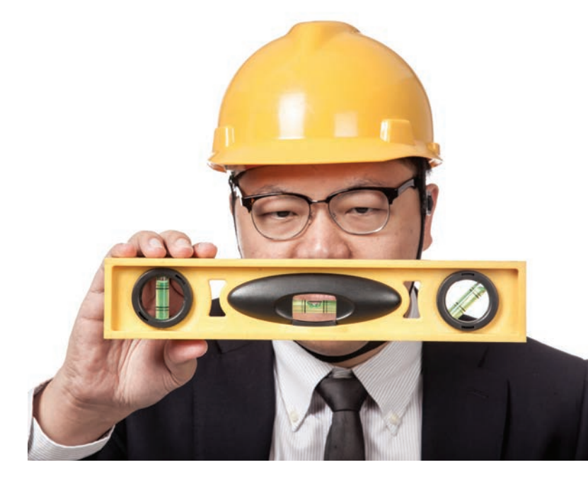
"There are several golden opportunities in the life of a dispute when risk and opportunity balance in such a way that mediation will have the best chance of success."

Frequently, mediation is not considered until just before commencement of the trial or arbitration hearing, when parties feel that they well understand that the risk of an adverse judgment gives them their last best chance to settle the case. By this time, virtually all the pretrial work has been completed, so the cost of trial may be less intimidating and provide less justification for settling. Having committed this much time and effort to the cause, the parties may feel they might as well take their chances at trial. Mediation just before trial may still yield positive results. After discovery has been completed and final trial preparation has begun, everyone involved should have the most information that is available, from which they can realistically evaluate their prospects at trial, as well as an understanding of the