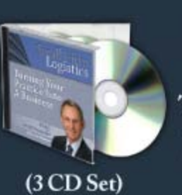
Small Firm Logistics: Turning Your Practice into a Business

The key to business development success is building relationships with potential clients. Relationship development is a marathon, not a sprint, and it starts