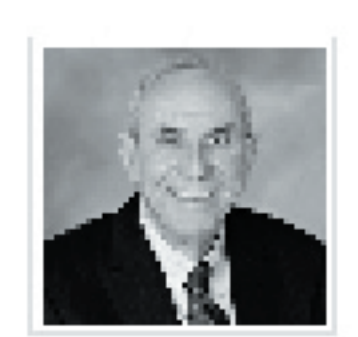
нон, ыз кананирал (алт.).