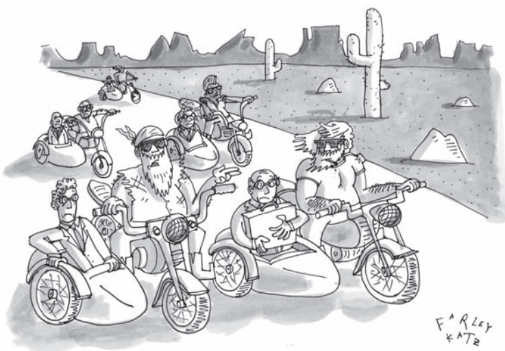
"Things have been going much more smoothly since we started riding with representation."

In contrast, outside counsel hired to conduct an inquiry will not share in-house counsel's potential conflicts of interest, will most likely have greater experience with internal investigations, and be adept at responding to shareholder claims or agency investigations relating to the subject of the inquiry. Communications with outside